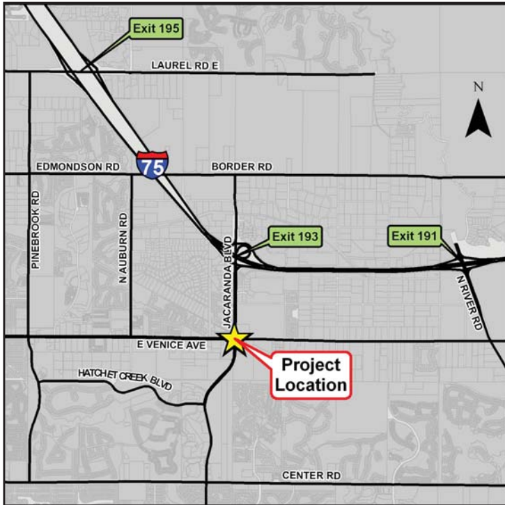
Map showing project location