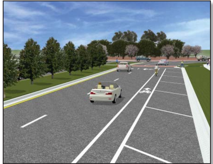
Artist's rendering of the roundabout with landscaping